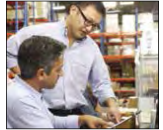
Custom financing packages