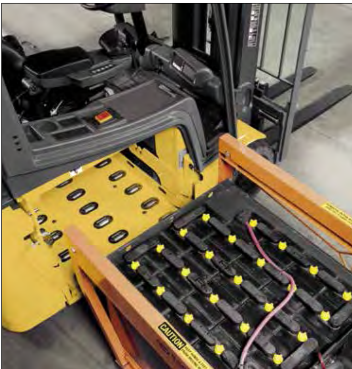
Roller Bed Extraction