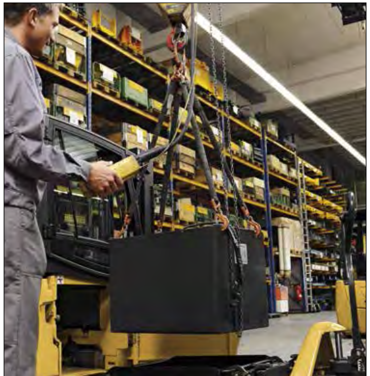
Crane Extraction with SnapFit