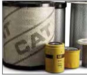
Genuine OEM parts