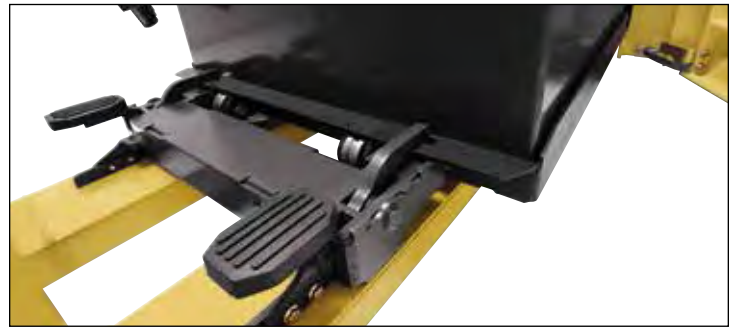
Pallet Jack Extraction with SnapFit