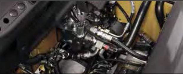
Factory warranty for added protection