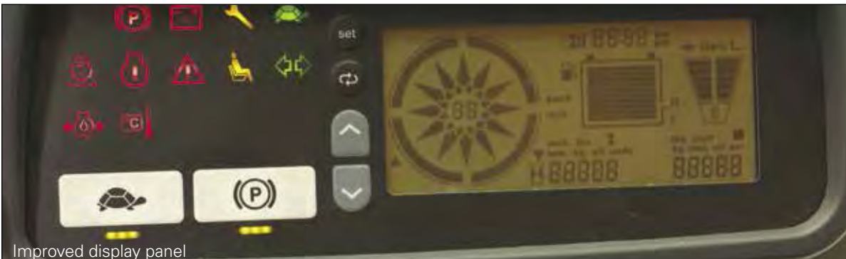
Improved display panel

featuring an integrated direction switch and horn for low-effort handling and precise control.