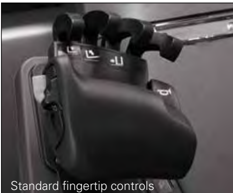
Standard fingertip controls

The lift truck's smart design provides visibility to the work area. The open layout of the overhead guard, and slim mast profile, offer forward visibility when driving and lifting. Programmable forward work lights provide ample lighting for various work environments.