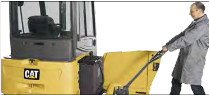
Battery Access for maintenance (standard equipment)